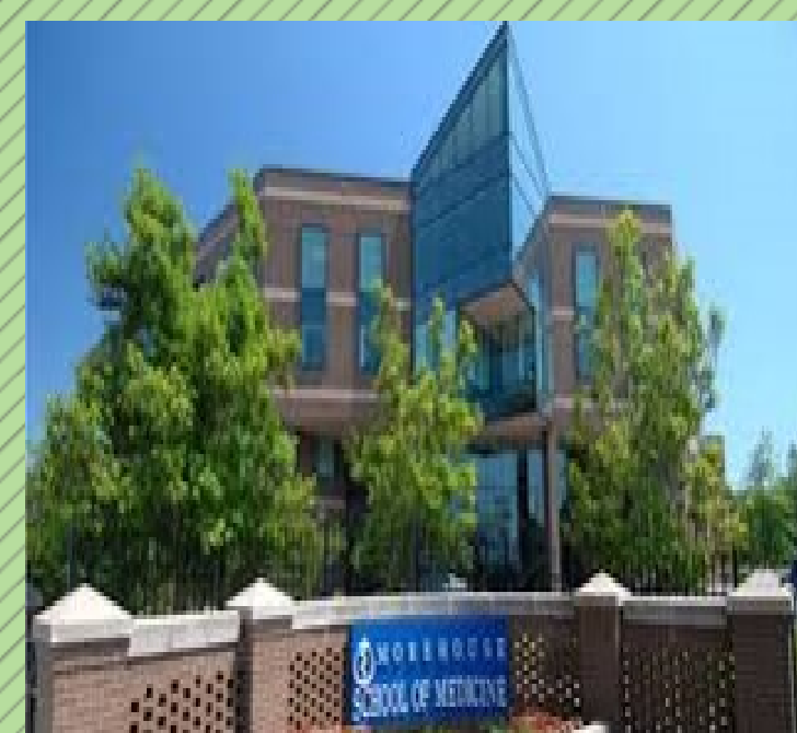
Morehouse School of Medicine