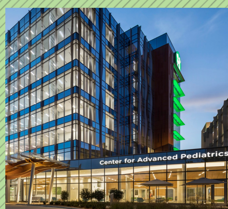
Center for Advanced Pediatrics