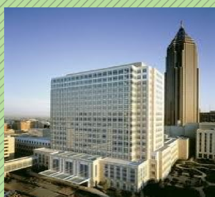
Emory University Hospital Midtown