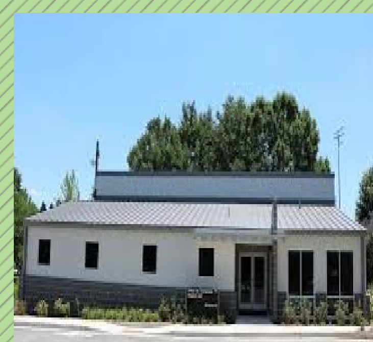
University of Georgia