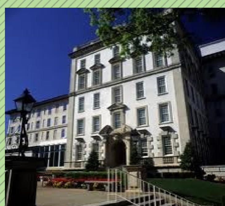
Emory University Hospital